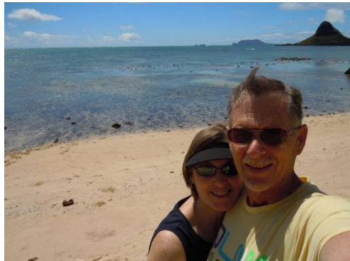
Relaxing on a beach in Hawaii !